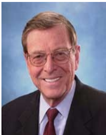
Sen. Pete Domenici

The new rules implement the Wellstone and Domenici Mental Health Parity and Addiction Equity Act of 2008 (MHPAEA) which requires that any group health plan that includes mental health and substance use disorder benefits must treat them equally with any medical and surgical coverage in terms of out of pocket costs, benefit limits and practices such as prior authorization and utilization review. The new rules are effective for plan years beginning on or after July 1, 2010.