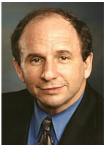
Sen. Paul Wellstone

On January 29, 2010, the U.S. Departments of Health and Human Services (HHS), Labor, and the Treasury jointly issued new rules providing parity for consumers enrolled in group health plans who need treatment for mental health or substance use disorders.